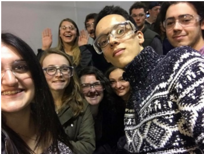
Boston University Metropolitan College

"BU is one of the most prestigious universities in the world, and the fact that it was in the United States helped me get visibility from companies like Google and Amazon, where I interviewed. As soon as I arrived at BU, I could meet people working there at career fairs and meetups, and that really helped me create a network that eventually led me to interview for those companies."